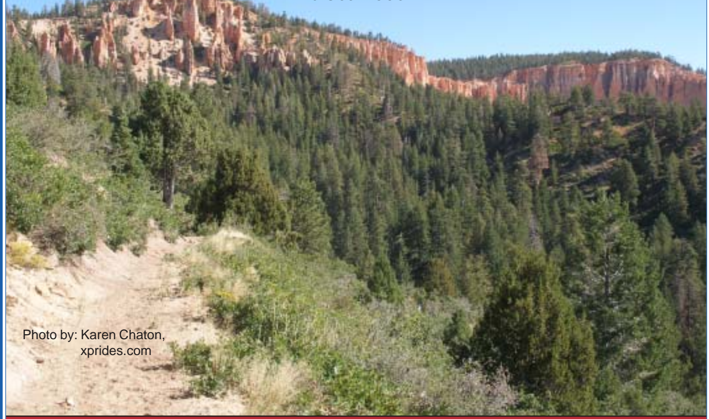
Photo taken at the Bryce Canyon, Utah XP Ride Where ASAV's West Coast National Distance Championship Ride will be held on Sept. 2, 2007

ASAV's President's Message NASS's President's Message ASAV Awards Given Report From the PNR Convention BOD Minutes New Anglo-Shagya Registry National Meeting Set Classifieds