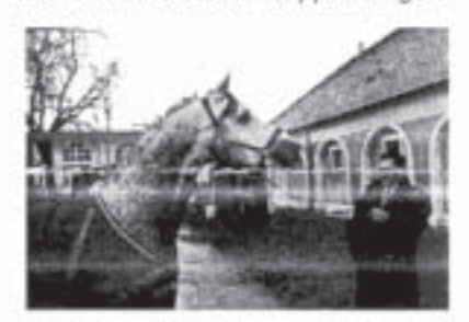
Foto: Sahman ShA v Shagan e.d. Halima 631 Furtherone some Shagya-Arabian Stallions were showed. The in sport succesful Raon ShA

In the nice hall of Stadl Paura was one highlight the _eight-horse Quadrille" from the stable Hoppenberger.