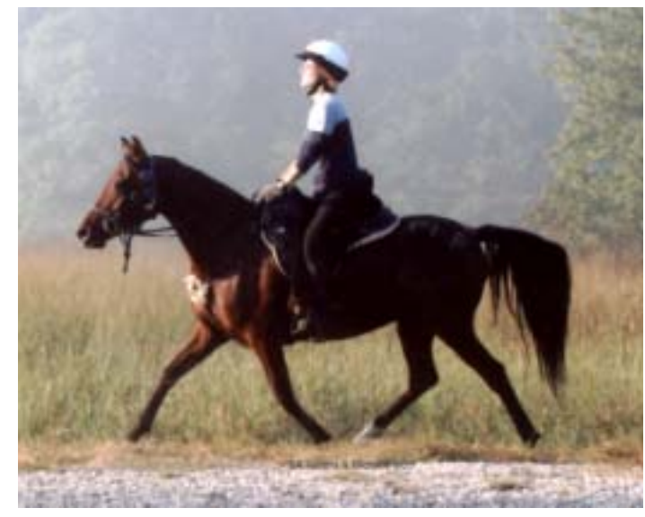
Who and where is this? Answer elswhere in the newsletter.